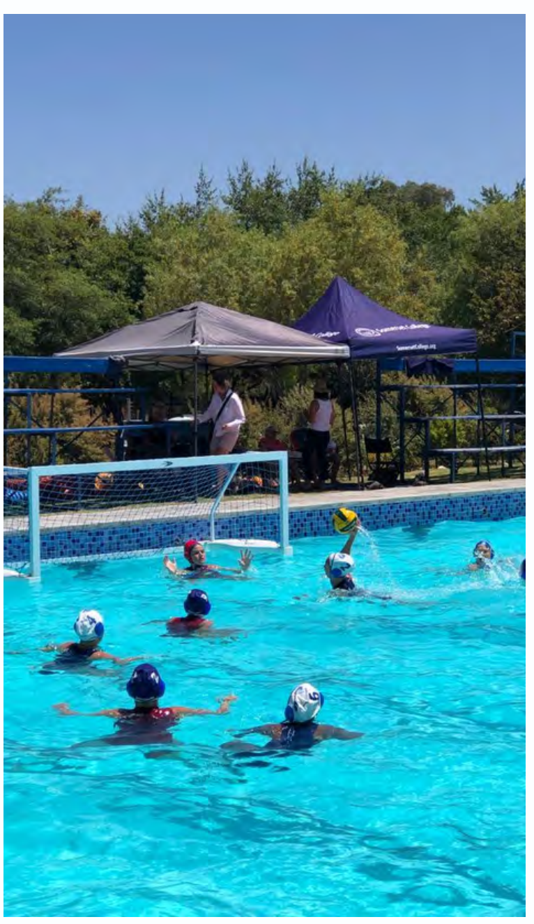
"Team work makes the Dream work